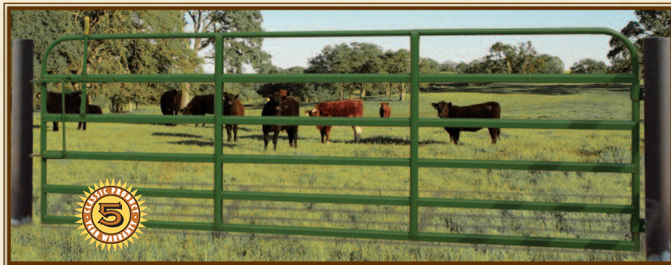
Classic 52-inch Gate with Lever Latch

M ade to the same heavy-duty specifications as our Classic Panels, and featuring the same Classic Five-Year Limited Warranty, this gate is a must for crowding situations. Like the Classic Panels, this gate can withstand large amounts of pressure and spring back to its original shape. The hinge is another key ingredient in the formula for strength. Made of 1/4-inch x 3-inch steel, these 180-degree hinges can be mounted to wood or welded to steel posts. A double-piston lever latch provides opening ease while on the ground or on horse back.